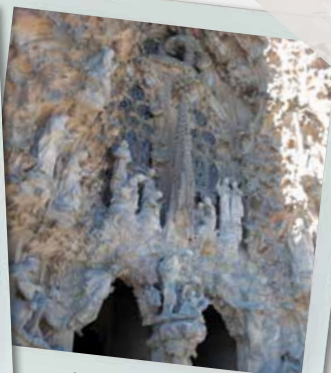
Some of the amazing architecture on show