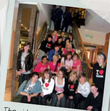
The girls do their best to block the stairs

"The students were the best we have travelled with for a long time. You are all a credit to yourselves and the school"