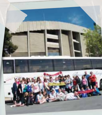
Students and staff outside the Camp Nou